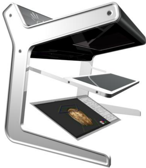
Personal Space Station (PSS)